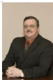
Labrador City Mayor Graham Letto